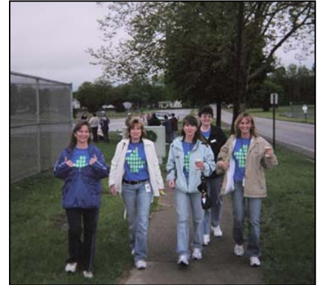
Smart Commute in Jackson

There are many communities throughout Michigan that are participating in Smart Commute.